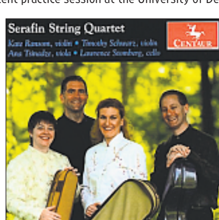
the midst of recording their second album.